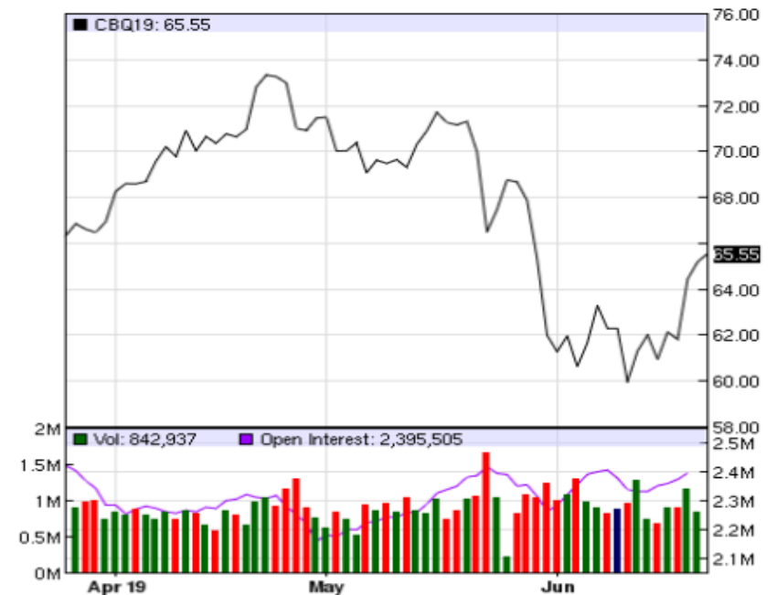
(Q2 2019 Crude Oil Tracker)